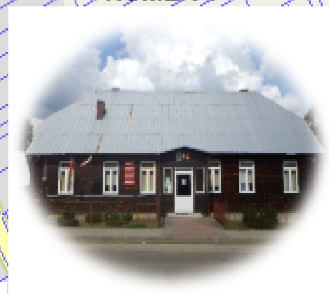
OBSZAR NUMER 1