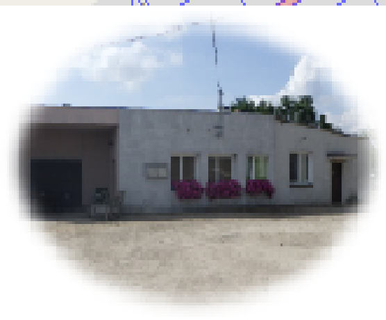
OBSZAR NUMER 3