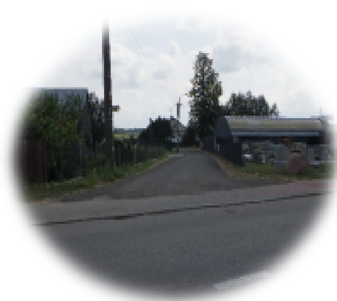
OBSZAR NUMER 4